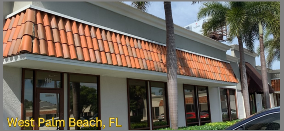
West Palm Beach, FL

Our West Palm Beach office provides outpatient services with a holistic, wellness-focused approach, supporting individuals on their path to lasting recovery.