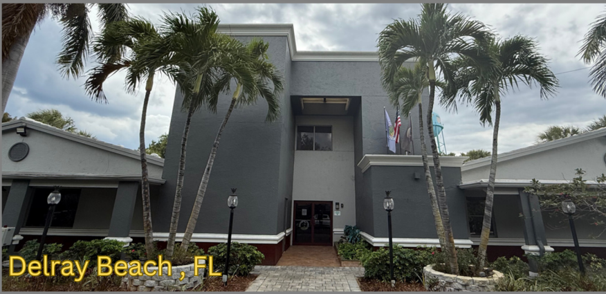
Delray Beach, FL

Our main campus fosters a supportive, trauma-informed environment that prioritizes safety and trust, empowering individuals on their recovery journey.